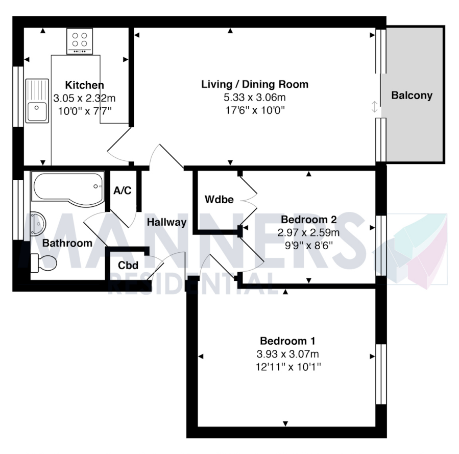
Total Approx. Gross Internal Area 57.1 m<sup>2</sup> ... 615 ft<sup>2</sup> (excluding balcony)

All measurements are approximate and for display purposes only. Not to scale.