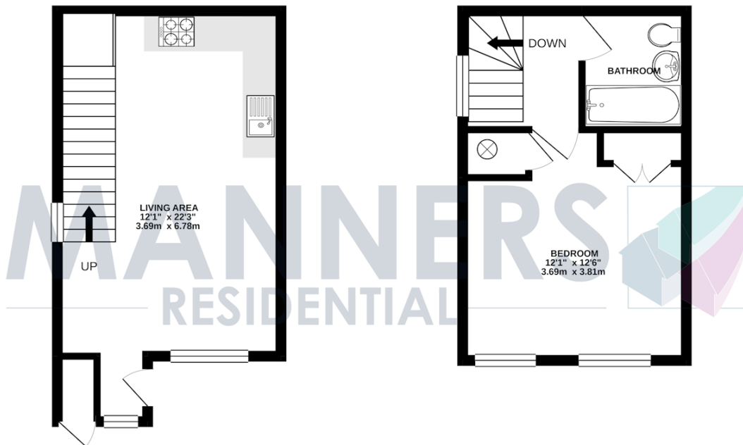
1ST FLOOR 229 sq.ft. (21.3 sq.m.) approx.

TOTAL FLOOR AREA : 473 sq.ft. (43.9 sq.m.) approx.