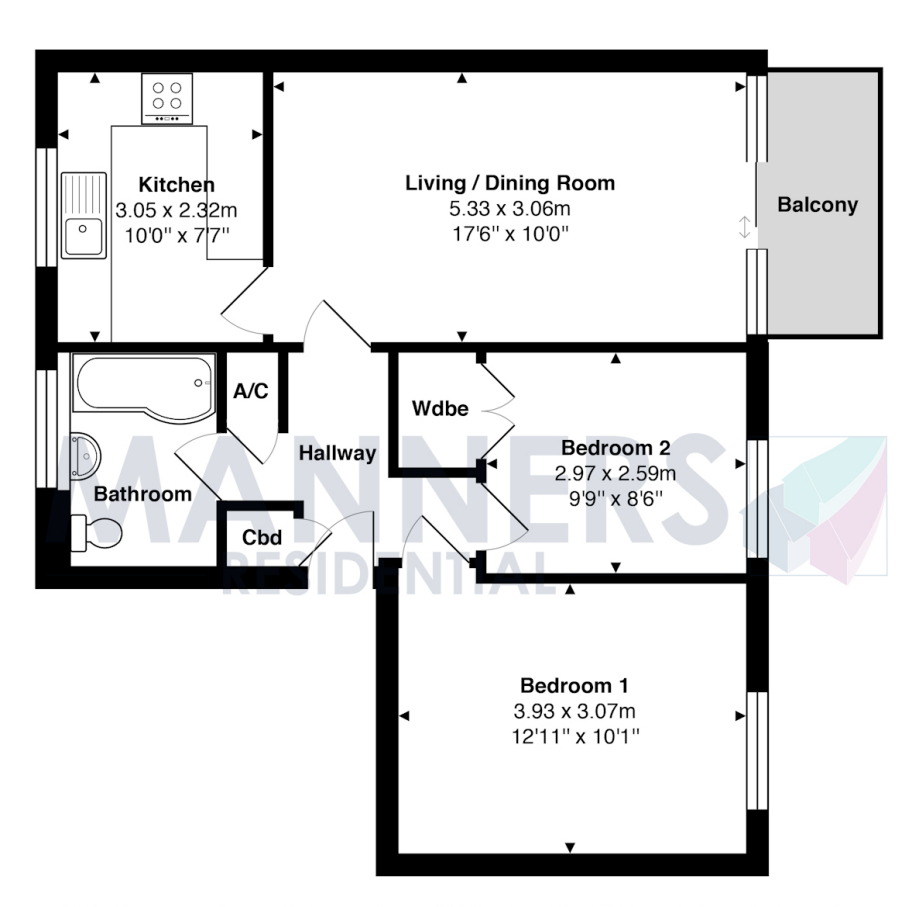
Total Approx. Gross Internal Area 57.1 m<sup>2</sup> ... 615 ft<sup>2</sup> (excluding balcony)

All measurements are approximate and for display purposes only. Not to scale.