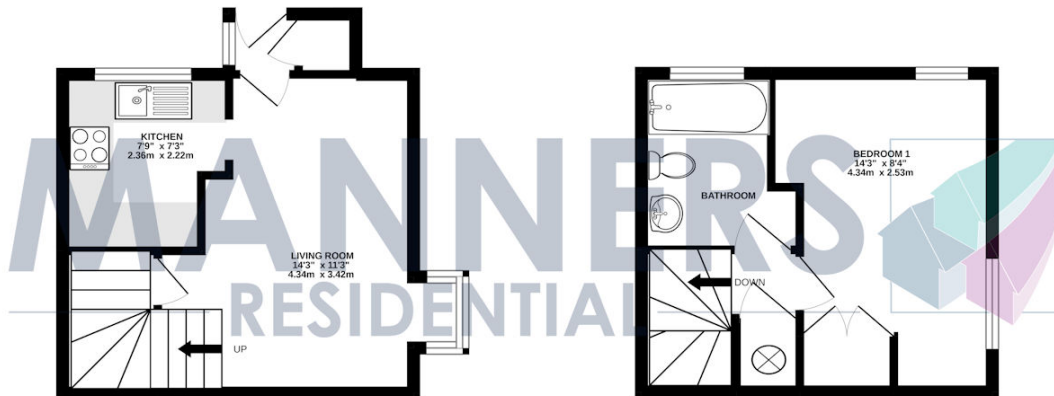
1ST FLOOR 223 sq.ft. (20.7 sq.m.) approx.

TOTAL FLOOR AREA: 445 sq.ft. (41.4 sq.m.) approx.