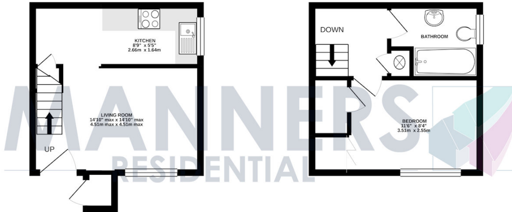
1ST FLOOR 219 sq.ft. (20.3 sq.m.) approx.

TOTAL FLOOR AREA: 437 sq.ft. (40.6 sq.m.) approx.