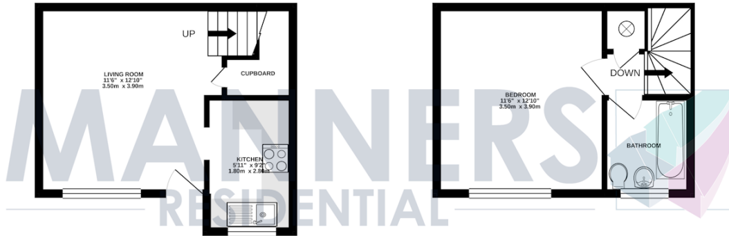
1ST FLOOR 222 sq.ft. (20.7 sq.m.) approx.

TOTAL FLOOR AREA - 460 sq.ft. (42.7 sq.m.) approx.